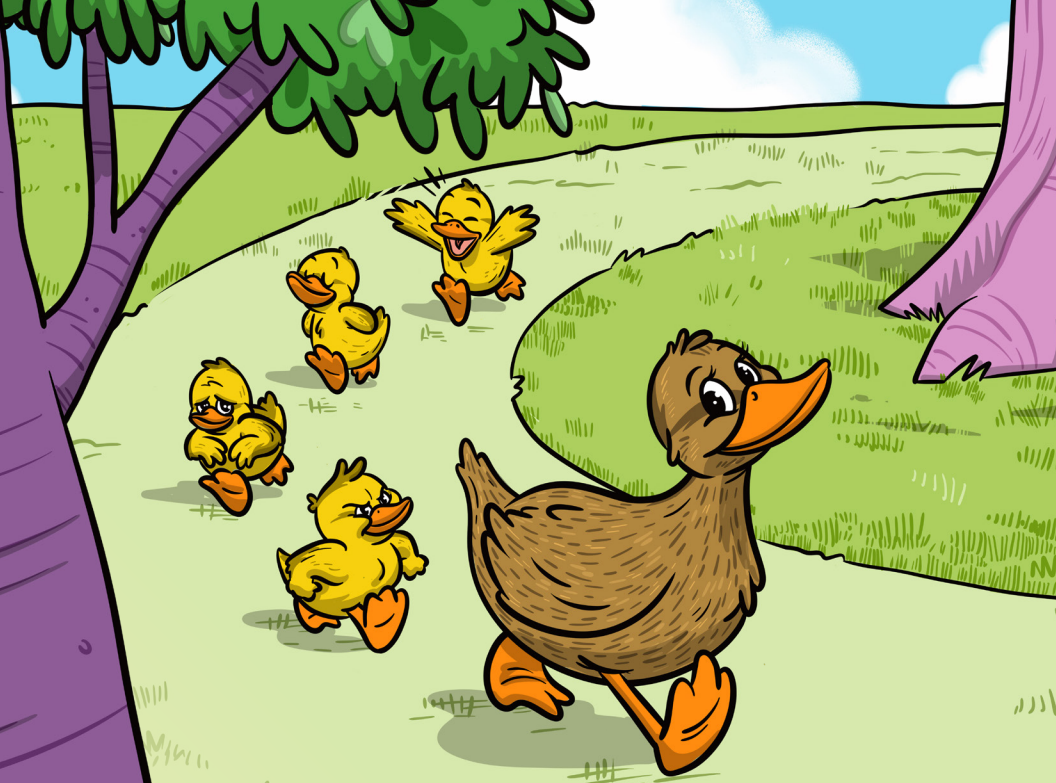
Illustration by Victor Davila